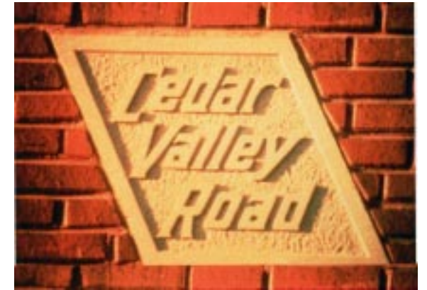
Logo used by the Waterloo, Cedar Falls and Northern Railroad Company

A Joint Project of the Black Hawk & Linn County Conservation Boards