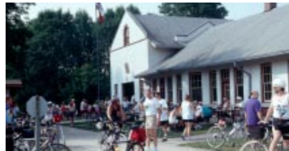
Restored depot at Center Point

Picnicking, water, playground, and lodge. For more information contact Linn County Conservation at (319) 892-6450.